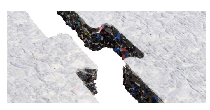
Puzzle shaped ProPlay® for Playgrounds fall protection pad

ProPlay® for Playgrounds is a vital part of the artificial grass system for playgrounds. The product performs in all weather conditions and is renowned for its excellent water permeability.